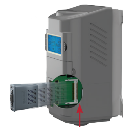
Anybus slot and 50-pin CompactFlash connector on the PCB of the host device