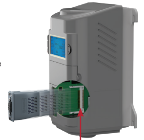
Anybus slot and 50-pin CompactFlash connector on the PCB of the host device

HMS offers a customized CompactFlash connector for Anybus CompactCom. The module insertion can be made at any stage in the logistical chain between the automation device manufacturer and the end customer. CompactCom slot cover available on request from HMS.