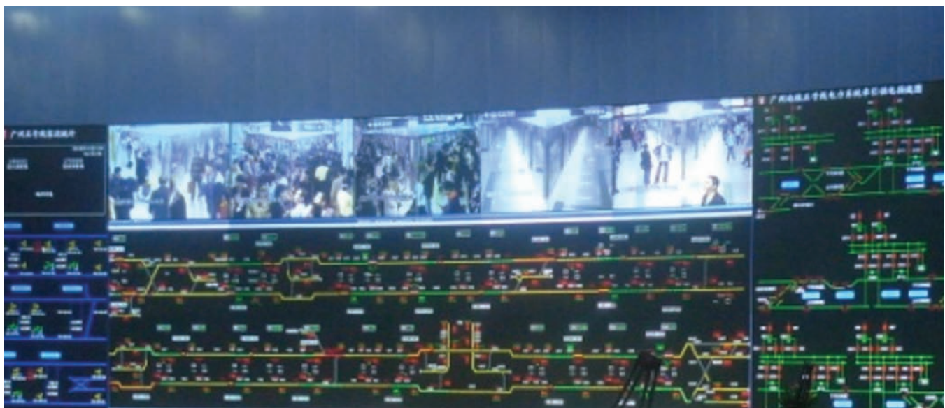
Guangzhou Metro Line 5 Control Center