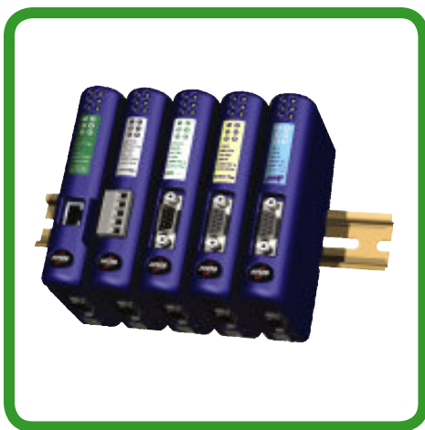
Anybus Communicator Serial to network gateways

Anybus Communicator and Anybus X-gateway bring different networks safely together! Proven Anybus technology connects your devices or your network to other automation systems and PLC's.