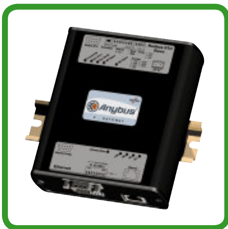
Anybus X-gateway Network to network gateway

Network-enable your serial device! There is one separate version of Anybus Communicator for each major industrial network, such as EtherNet/IP, Modbus TCP/IP, FIPIO, Modbus RTU, Modbus Plus, Profibus-DP and DeviceNet. On the serial side, Anybus Communicator is as default configured as a fully implemented Modbus RTU Master, which is designed to communicate with a subnet with one or several Modbus RTU slave devices. However, it can also be configured to support other serial protocols as well as simple ASCII-communication. The PC-based ABC Config Tool allows easy step-by-step configuration of the communication between devices on the serial subnet and the PLC master on the other side of the Anybus Communicator. The configuration can be saved and re-used in future integration projects.